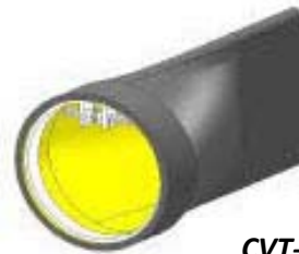
CVT-E Model DUCKBILL