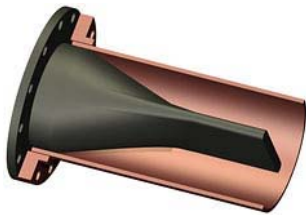
CVI-F Model DUCKBILL

http://www.powercanadasolutions.com/checkvalves.html