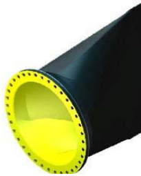
CVF Model DUCKBILL